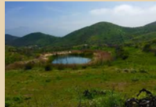
Dos Vientos Ranch