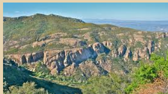
Santa Monica Mountains trail systems