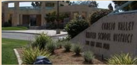
Conejo Valley Unified School District