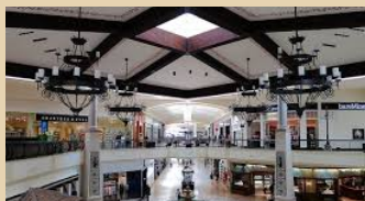
The Oaks Mall