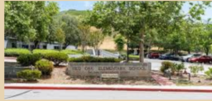
Oak Park Unified School District

School performance data available at: Niche Rankings , GreatSchools , California School Dashboard