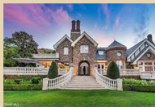
Country Club Estates