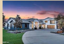
North Ranch (Estates at North Ranch)