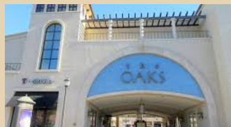
Thousand Oaks Boulevard corridor